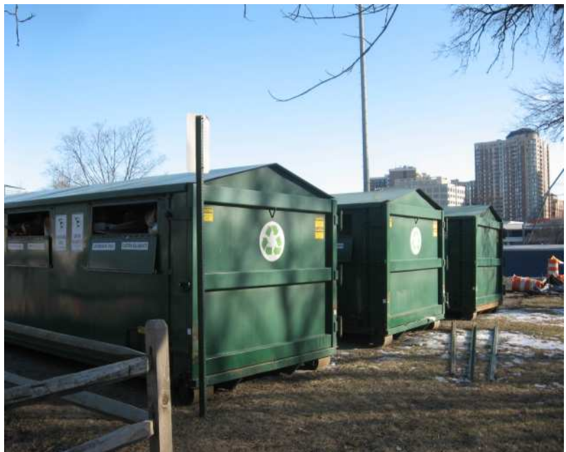
Recycling drop-off center at Quincy Park