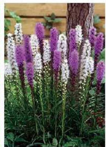
Gayfeather - Liatris sp.

Examples of plants for a pollinator garden, with pollinators at work.