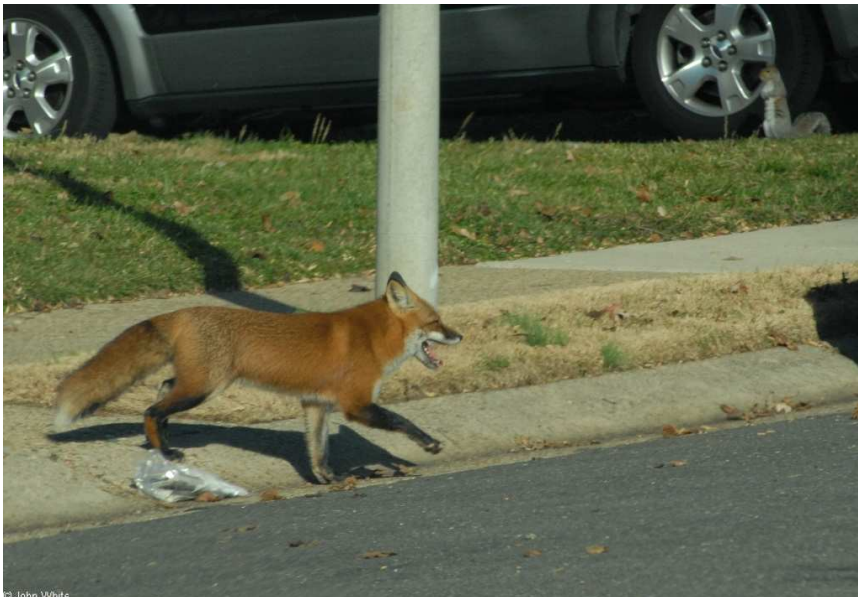
A red fox passing a grey squirrel. Predator and prey populations are cyclic.

The dearth of acorns together with abnormally low temperatures could lead to a reduction in the