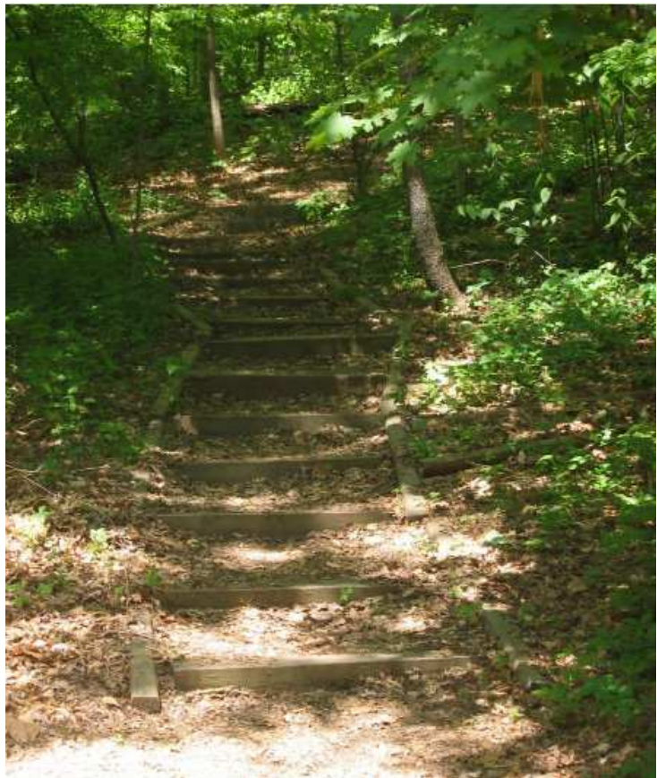
Section of trail in Gulf Branch Natural Area.

Another element of this project is to repair some of the extensive system of trails (see photo to the right) in the Gulf Branch Natural Area. The trails are bordered by 'trail timbers' with mulch filling the area between the timbers. Repairs along the trail will include replacing missing or damaged timbers and then calling on volunteers to add the mulch.