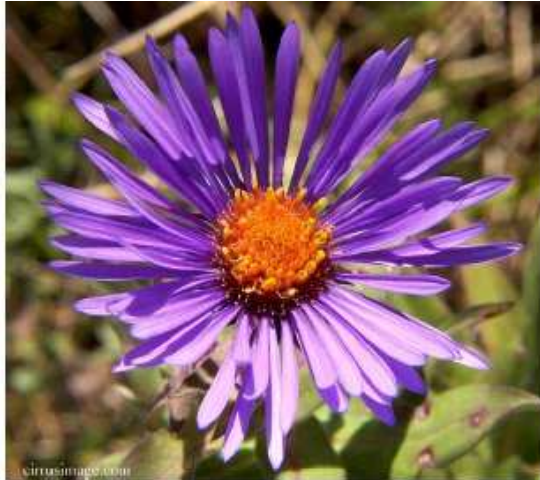
New England Aster - Aster novae-angliae

Nature Center staff will use the pollinator garden to give park visitors hands-on learning opportunities and encourage them to create pollinator gardens in their own yards. The garden will be in a highly visible site on a busy street, so many others are expected to stop for self-guided visits. Interpretive signage will be provided to help visitors understand the garden's purposes.