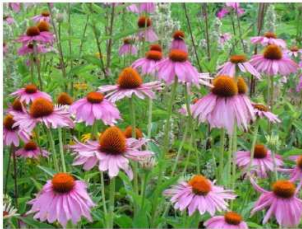
Purple Coneflower - Echinacea purpurea

Master Naturalist candidates will also plant the garden. Plants have not been selected yet, but some possibilities are shown in Exhibit E (below and on page 3) of the PEG application submitted by Old Glebe Civic Association. The Nature Center will recruit Master Naturalists, Master Gardeners, and other volunteers to assist with maintenance.