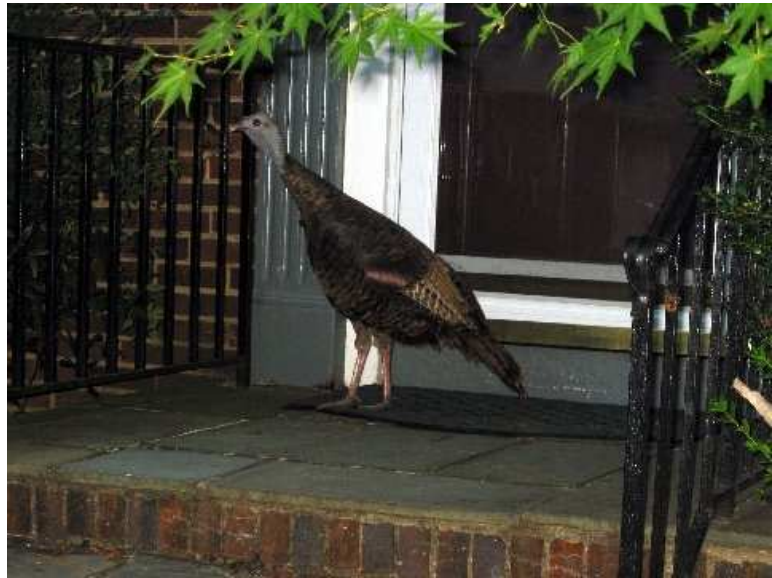
The few wild turkeys in Arlington feed heavily on acorns in the fall.

population of squirrels, chipmunks and mice this winter. That, in turn, could lead to a reduction in the population of predators such as red foxes, large hawks, and owls next spring and summer.