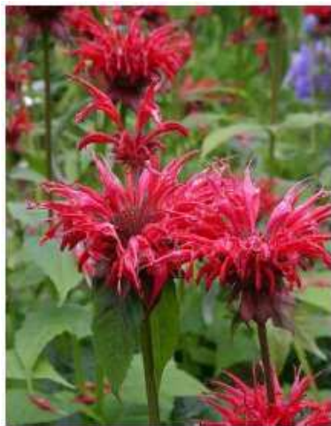
Bee Balm - Monarda didyma