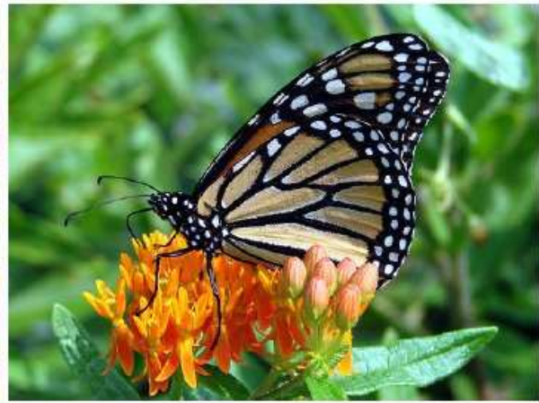
Butterfly Weed - Asclepias tuberosa