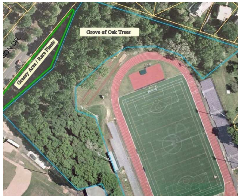
Aerial view of the green space at Wakefield High School

The Wakefield woods and grassland present a wonderful opportunity for joint use for educational and community purposes. In addition to their use for passive recreation that could be enjoyed by the public, the stand of oaks, red maples, and sycamores and the rare plant community could serve as a valuable resource for biology and environmental science classes. Preserving these trees and other plants would further Arlington environmental initiatives and could be regarded as a model of environmental protection during school construction. The oak grove provides a buffer between George Mason Drive and the school