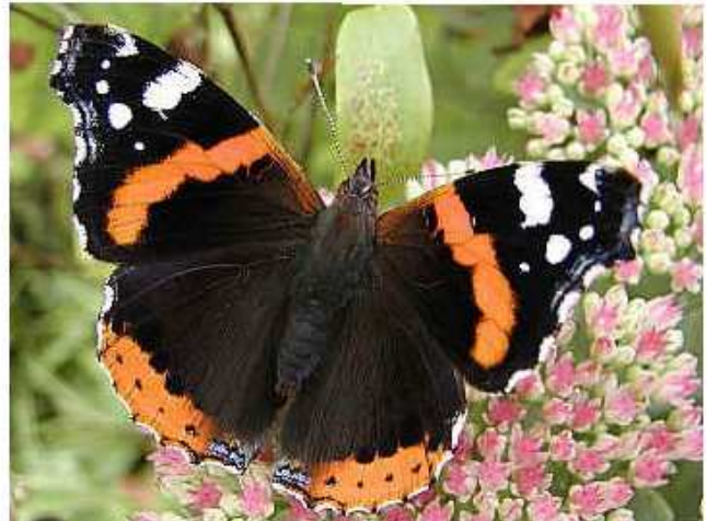
Stonecrop - Sedum sp.

Another element of this project is to repair some of the extensive system of trails (see photo to the right) in the Gulf Branch Natural Area. The trails are bordered by 'trail timbers' with mulch filling the area between the timbers. Repairs along the trail will include replacing missing or damaged timbers and then calling on volunteers to add the mulch.