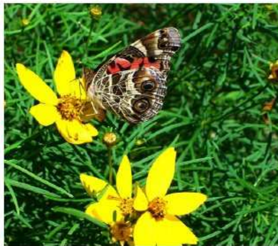
Coreopsis - Coreopsis sp.