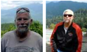
There are 131 photos in the gallery